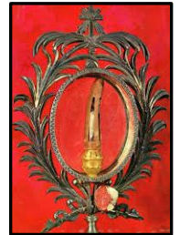
Relic of St Thomas’ finger which entered Jesus’ Sacred Wounds

It was easier for Jesus to bless than to condemn.